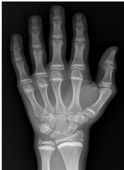
Fig. 2 (Рис. 2)